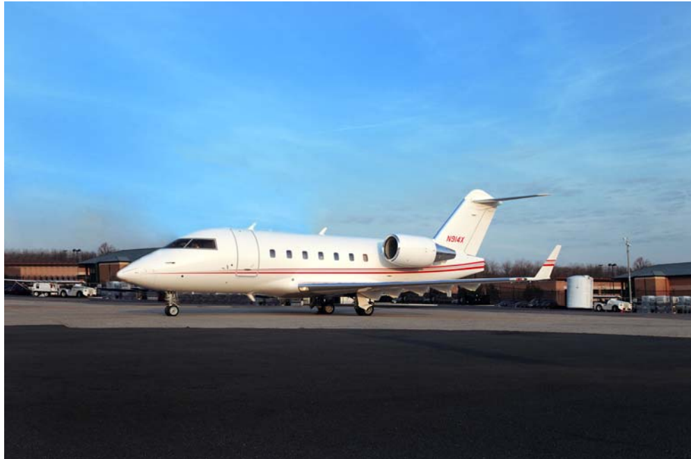
1995 Challenger 601-3R Serial Number 5185, N914X